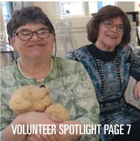
VOLUNTEER SPOTLIGHT PAGE 7

INCLUSION COMMUNITY CHOICE EMPOWERMENT RESPECT DIGNITY