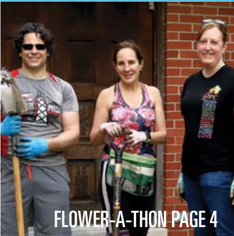
FLOWER-A-THON PAGE 4