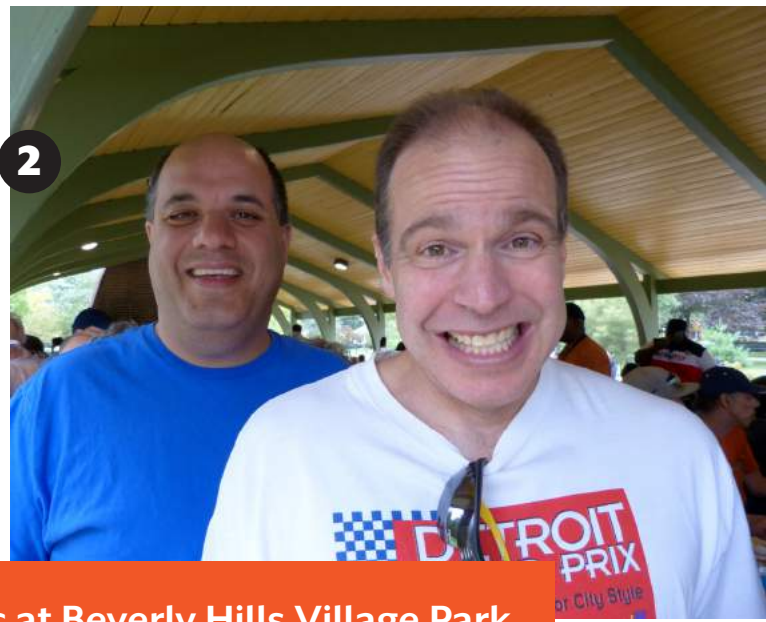
JARC's Annual Shabbat Picnic at Beverly Hills Village Park