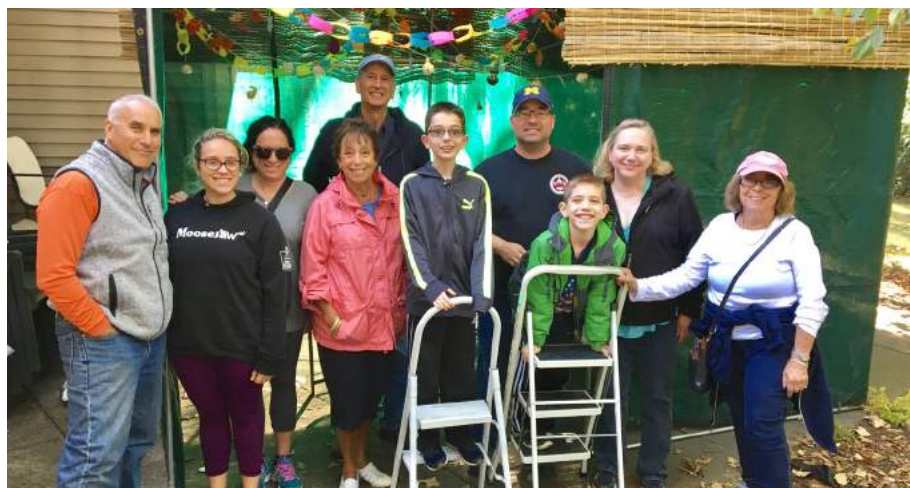
Our wonderful Sukkah volunteers at the Frederick H. Pitt Home!