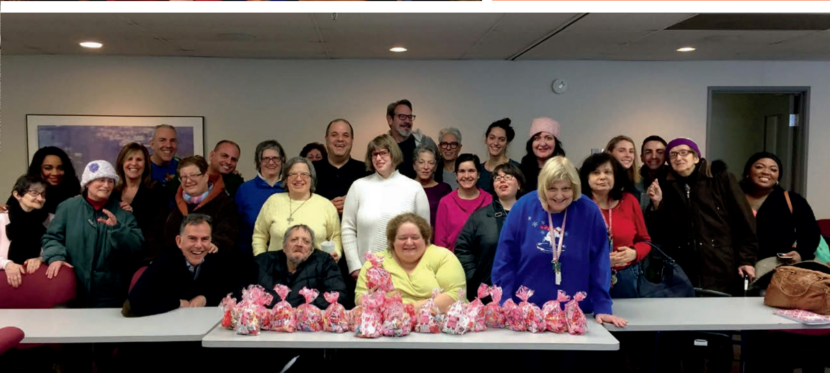
The 23rd Annual Heart to Heart volunteer crew assembled over 600 goody bags to donate to local children's charities.